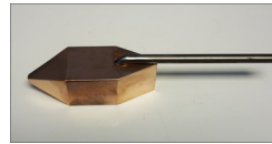
3/4 lb. Copper Tip